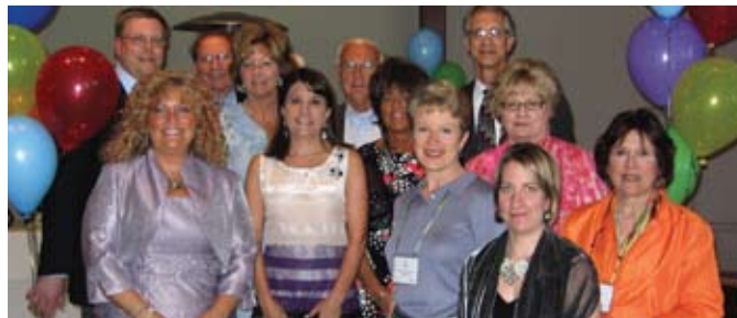
The 2011 Celebration Committee

In 2010, $143,000 of Tulip Tree funds were used. Thank you to all who participated. You make an incredible difference for patients and their loved ones: