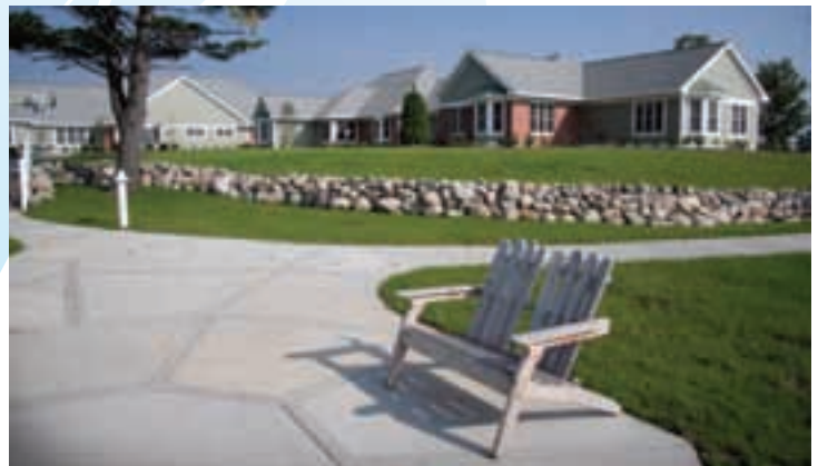
Located at 445 104th Avenue, the Hospice House offers "a home away from home"