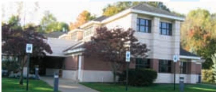
Hospice of Holland Main Office at 270 Hoover Blvd.